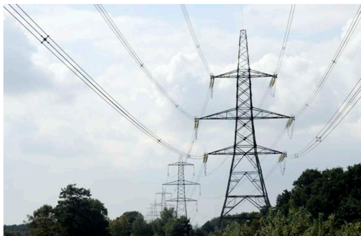
Figure 1 275 kV transmission line

6 Most overhead lines have wires supported on metal towers/pylons or wooden poles – they are often called ‘transmission lines’ or ‘distribution lines’. Some examples are shown in Figures 1–3.