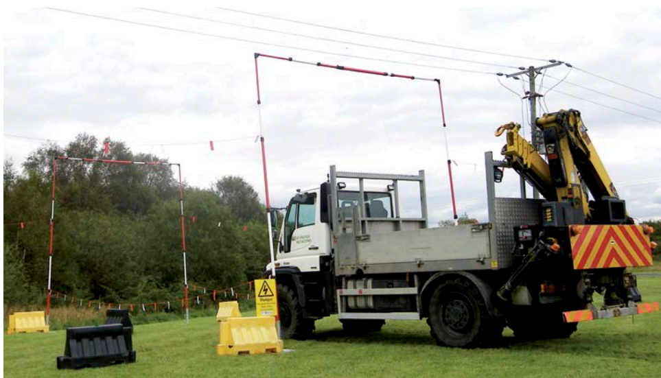
Figure 5 Typical passageway through barriers